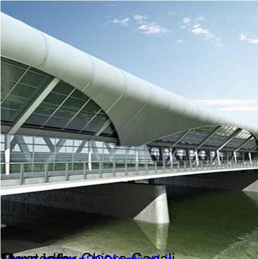
More info Chiara Canali