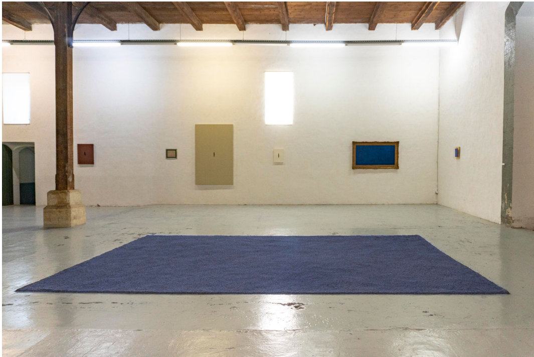
Group exhibition L.A.C. Lieu d'Art Contemporain, Sigeon (FR) July 6 - September 22, 2019